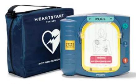
M5085A HEARTSTART TRAINER